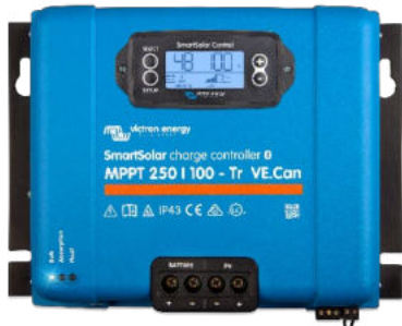
SmartSolar Charge Controller MPPT 250/100-Tr VE.Can with optional pluggable display