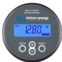
Bluetooth sensing: BMV-712 Smart Battery Monitor