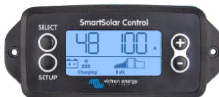
SmartSolar pluggable display

Simply remove the rubber seal that protects the plug on the front of the controller, and plug-in the display.