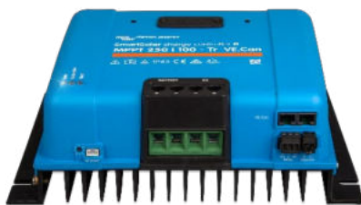
SmartSolar Charge Controller MPPT 250/100-Tr VE.Can without display