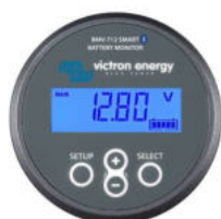
Bluetooth sensing: BMV-712 Smart Battery Monitor