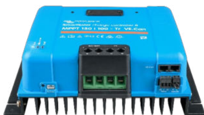
SmartSolar Charge Controller MPPT 150/100-Tr VE.Can without display