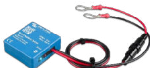
Bluetooth sensing: Smart Battery Sense