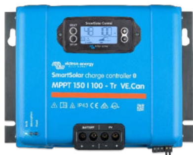
SmartSolar Charge Controller MPPT 150/100-Tr VE.Can with optional pluggable display