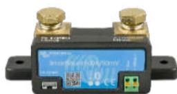
Bluetooth sensing: SmartShunt