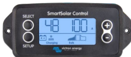
SmartSolar pluggable display

Simply remove the rubber seal that protects the plug on the front of the controller, and plug-in the display.